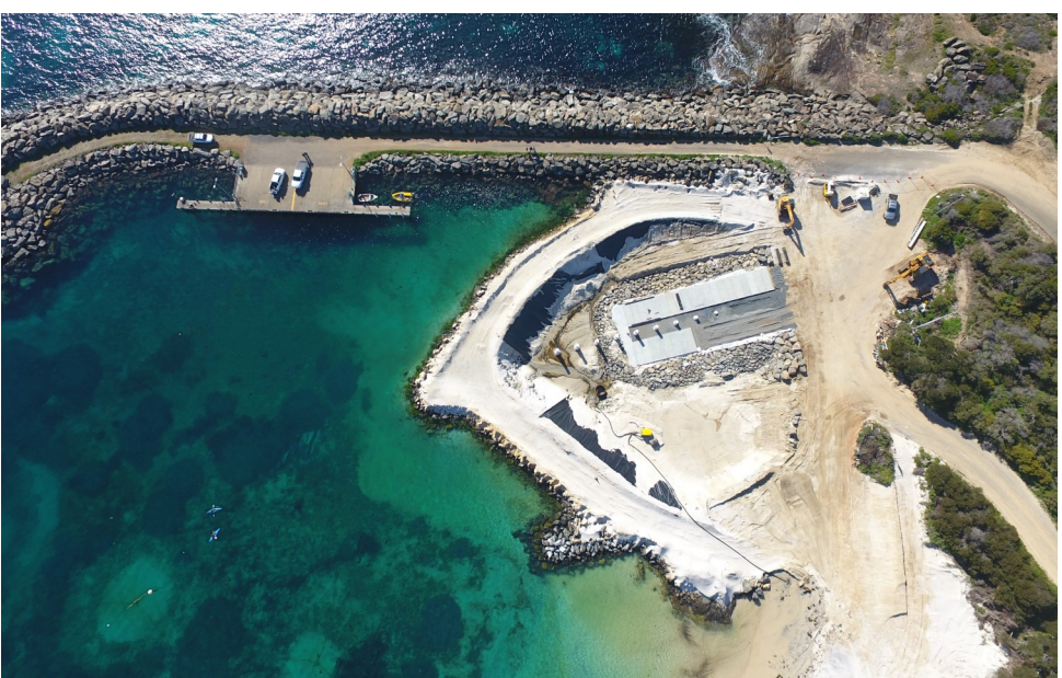
Construction underway on the new Boat Ramp and Finger Jetty at Fishery Beach Marina-July 2022

This project is funded by the Department of Transport Recreational Boating Facility Round 25 grant and the Department of Infrastructure, Transport, Regional Development and Communications Local Roads and Community Infrastructure (LRCI) Program.