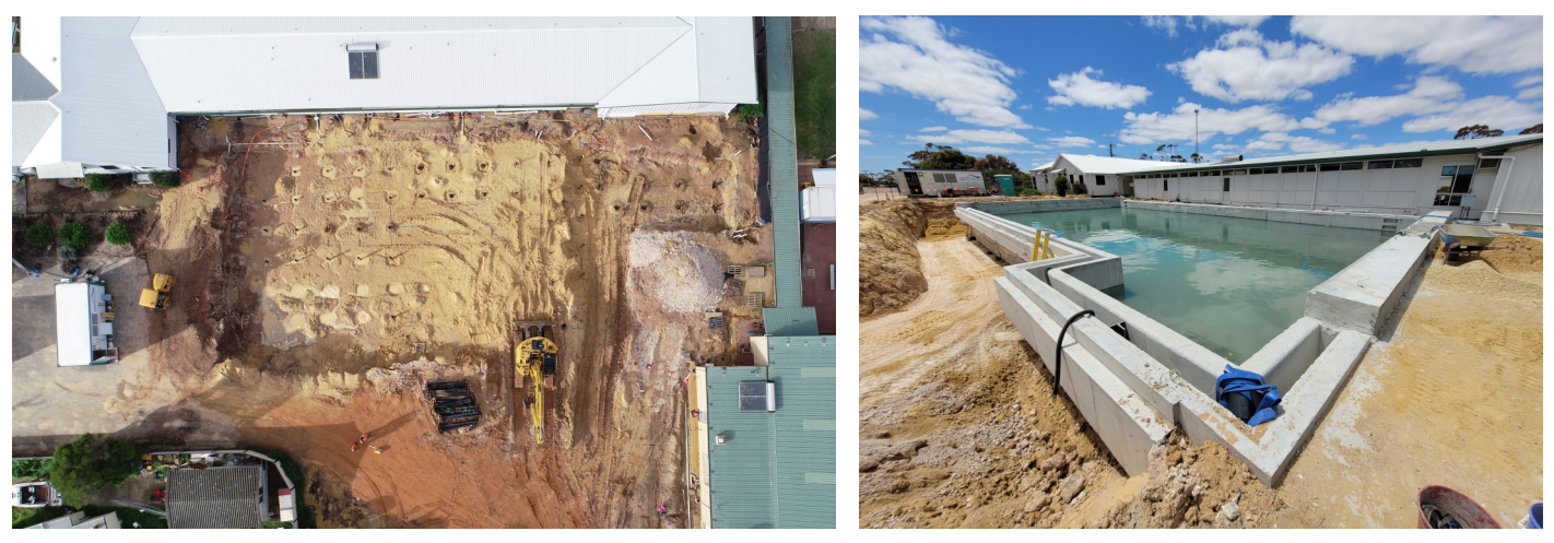
Above: Removal of the existing pool and construction of the new swimming pool facilities

Works on the new 25m main pool, toddler's pool, pump shed with accessories, male/female/accessible toilets, change rooms and first aid room at the Jerramungup pool precinct began in May 2021. At the time of budget being adopted this project has reached practical completion, meaning all construction works have been completed and all necessary approvals to operate the facilities have been obtained. The Shire is awaiting final invoices from contractors and once received will commence with grant acquittal and final reporting. A provision of $181,991 has been allocated in the 2022/23 budget towards consultant fees associated with the completion of the project.