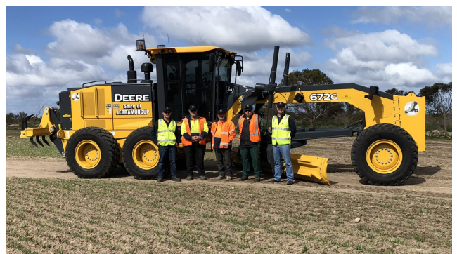
Shire of Jerramungup new John Deere grader