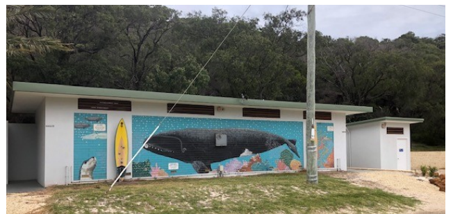
Renovated Paperbarks ablution block and new Universal Access Facility