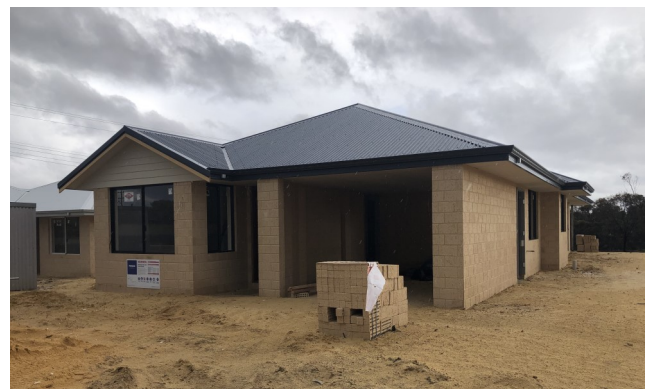
New residential house in Bremer Bay under construction