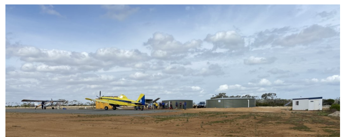
Bremer Bay Airstrip water bomber turn around

These upgrades to the water bomber turn around at the Bremer Bay Airstrip have decreased the turnaround times for water bombers, reduced wear and tear on planes and increased the capacity of the Bremer Bay Airfield to respond to bushfires in the surrounding district and most importantly in the Fitzgerald River National Park.