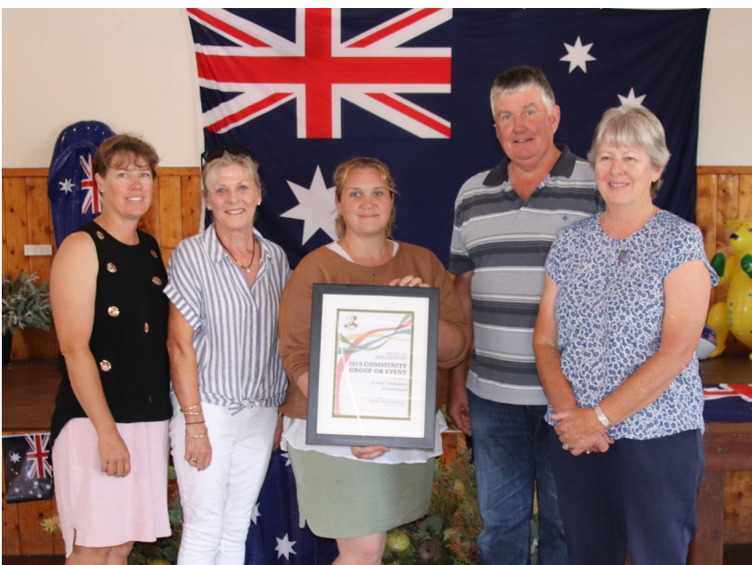
2019 Community Group/Event award recipient: St John Ambulance