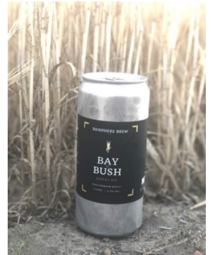
Dancing in the Dirt 'Biosphere Brew - Bay to Bush' and the FBG organising committee