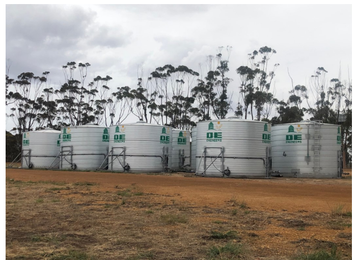
8 mobile water tanks installed at Jerramungup town site.