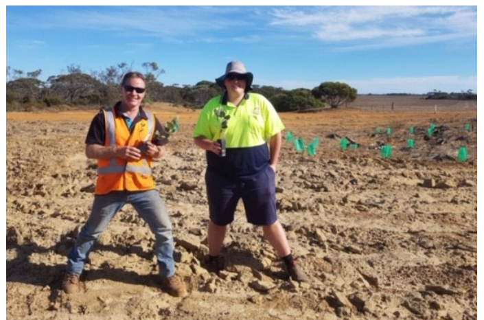
Meechi Road rehabilitation project