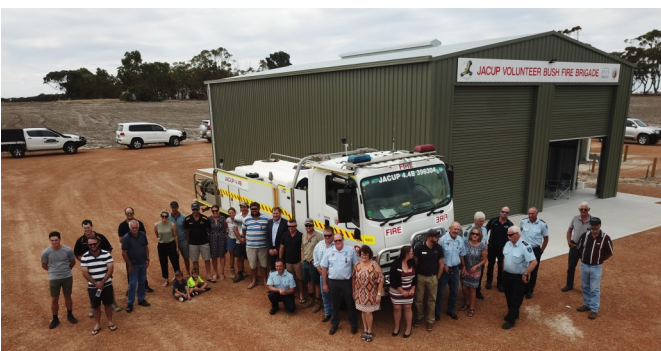
Opening of the Jacup Fire Shed