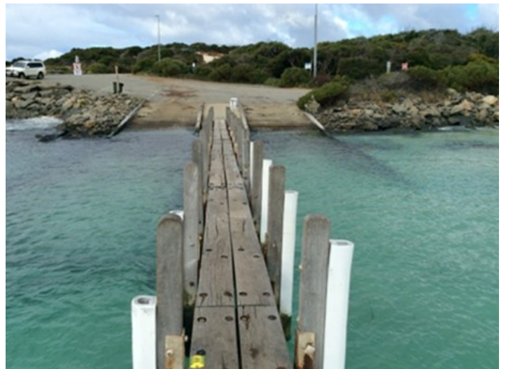
Existing Fishery Beach Marina—Recreational Boat Ramp and Finger Jetty (2017)